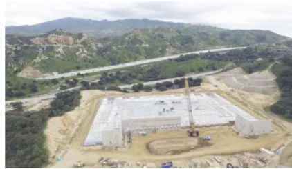
Needham Ranch Goes Vertical with Additional Phase Thursday, Mar 28, 2019