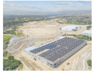
Next Phase of Needham Ranch Develop Thursday, May 30, 2019