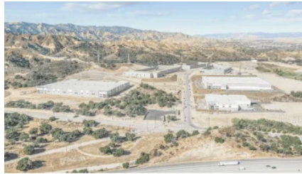
Walls Raised on Needham Ranch Project Tuesday, Oct 22, 2019