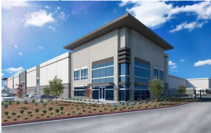
Building 10 is situated on 12 gross acres and is scheduled for construction to be complete by year-end 2021.

A joint venture between Trammell Crow Company, one of the nation’s largest commercial real estate developers and investors, and Clarion Partners has announced that construction on the next building at The Center at Needham Ranch has commenced.